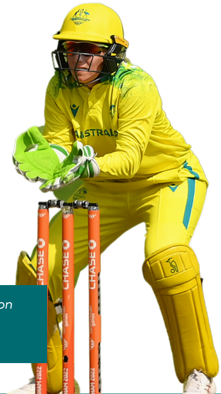
Alyssa Healy (Cricket) showcased champion catching skills at the Birmingham 2022 Commonwealth Games.