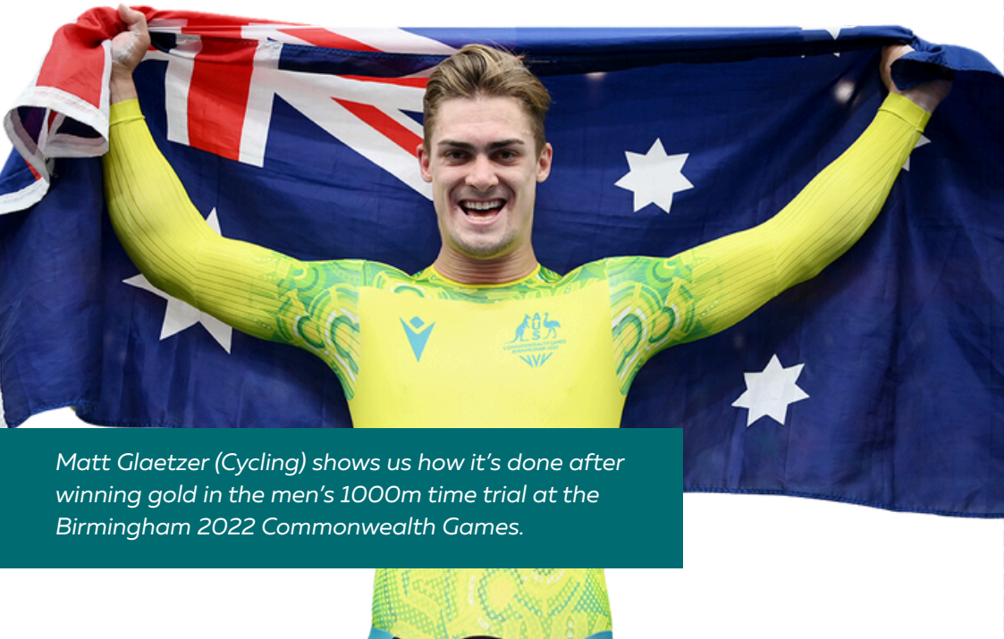
Matt Glaetzer (Cycling) shows us how it's done after winning gold in the men's 1000m time trial at the Birmingham 2022 Commonwealth Games.