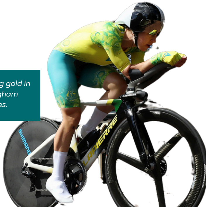
Grace Brown (Cycling) taking gold in Road Cycling at the Birmingham 2022 Commonwealth Games.