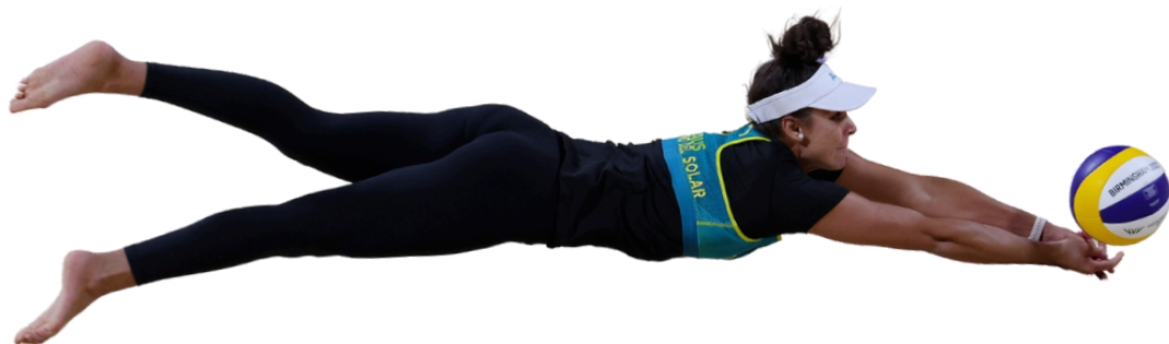
Mariafe Artacho del Solar (Beach Volleyball), stretches to make the save at the Birmingham 2022 Commonwealth Games.